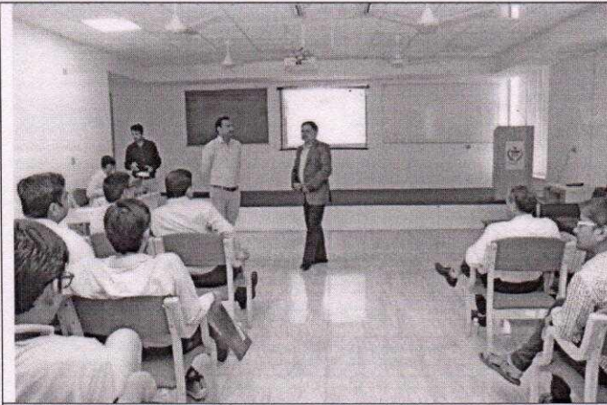
EPFO Awareness Program was started to sensitize employees with KYC Updation to EPFO website through access of UAN.