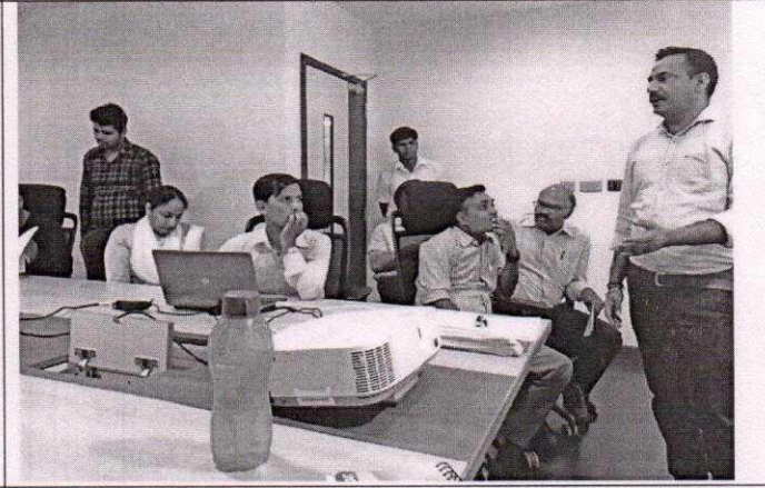
The departmental dissemination of information and training regarding the same is going on.